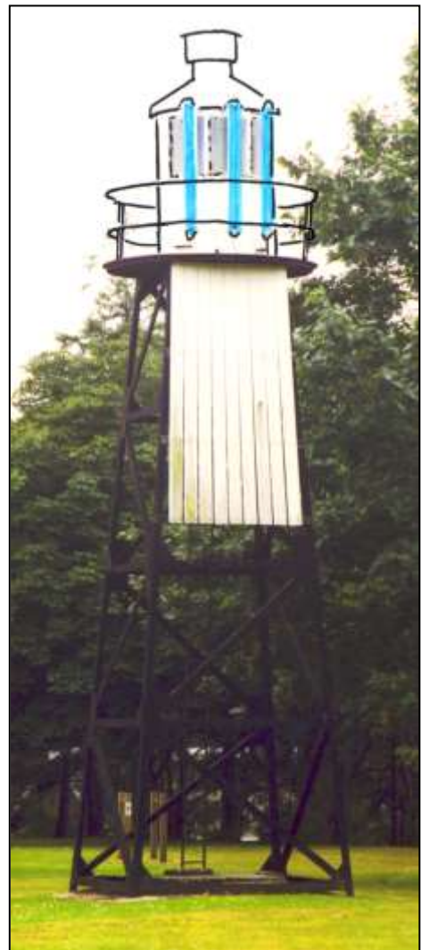
Above: Slime Road front light, early 1900s