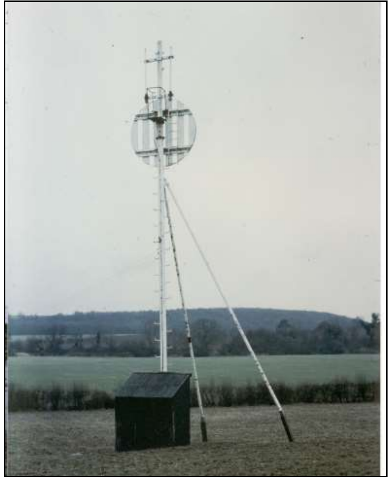
Inward Rocks: Front light (post-1907) and rear beacon (viewed from the NE) following electrification in 1962.