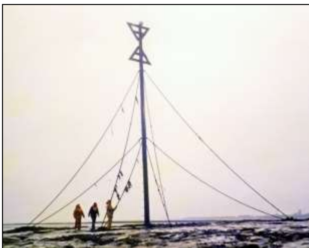
No. 1 Beacon (South)

Unlit beacons (No. 1 and No. 2) were established in 1891 to mark the eastern edge of the Shoots Channel. The wooden poles were 16m in length and are shown below, pictured in 1985.