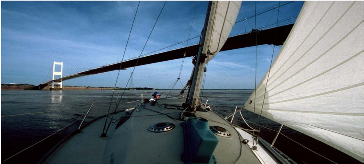
Sailing under the Severn Bridge

I approve, on behalf of the Trustees, the above report