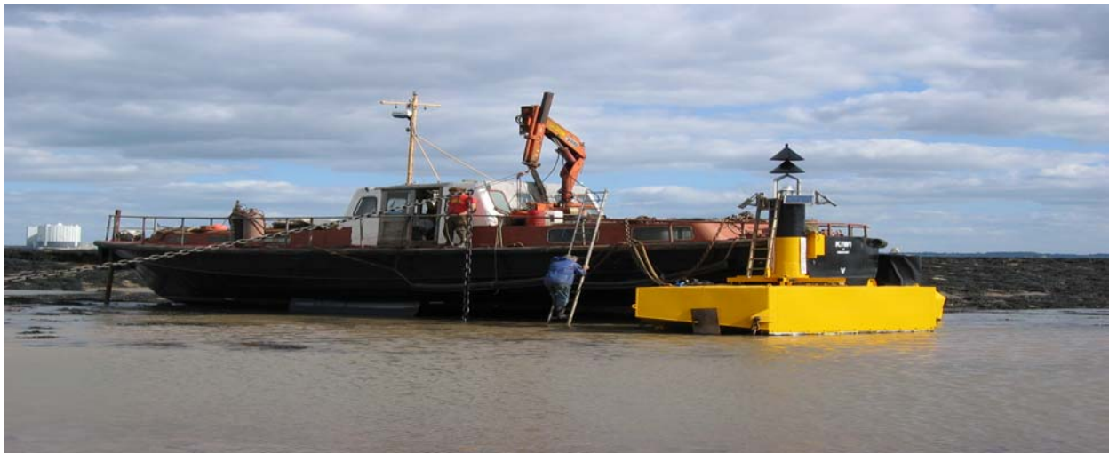
Buoy maintenance works, River Severn

The Trustees remain members of the British Ports Association and regularly participate in meetings of the South West Regional Ports Association and contribute to ASERA (Association of Severn Estuary Relevant Authorities) consultations.