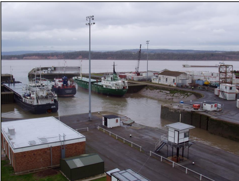
Four vessels manoeuvring at Sharpness Dock

The areas around port entrances may often be particularly congested (see below), and navigators of small craft should take care that the often strong tidal streams (often in excess of 6 kts) do not carry their craft too close to large ships.