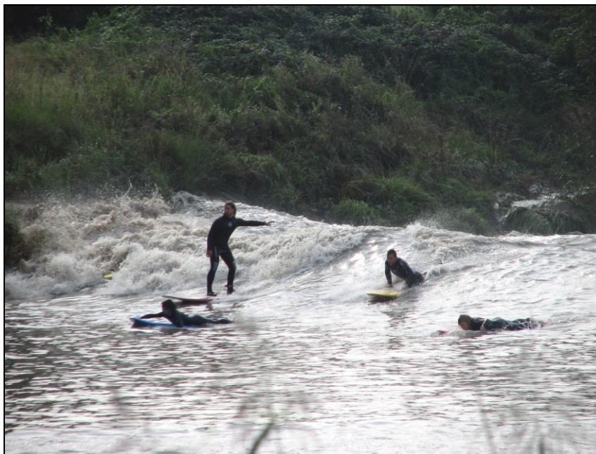
Surfers at Minsterworth (Roger Hopson)

In view of the clear additional risks attendant on surfing or boating on the bore, the Trustees strongly discourage surfing or boating in its vicinity.