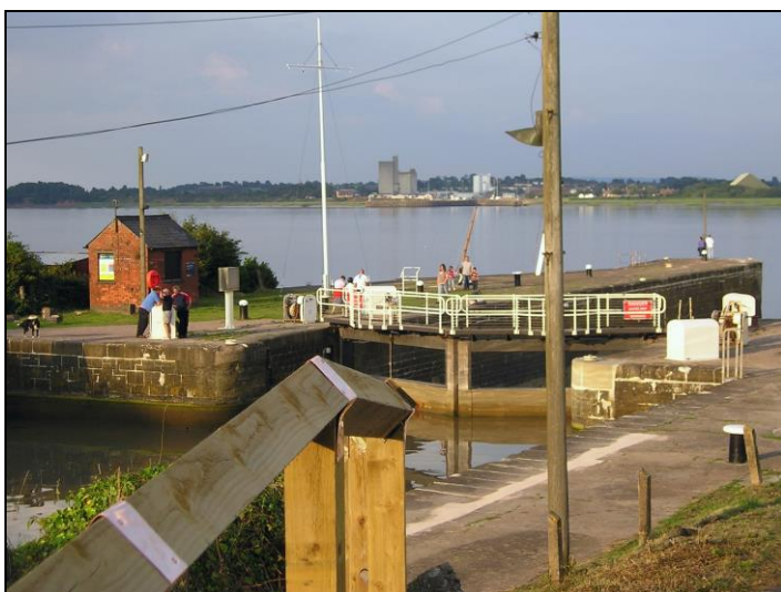
Lydney Dock (Rob Millar)

Vessels leaving Lydney should be ready to enter the lock 1 hour before high water. The dock is operational from one and a half hours before high water until high water.