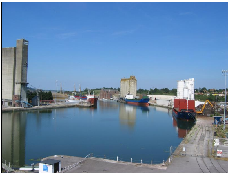
The Docks, Sharpness

If you have not booked a passage and do not intend to enter Sharpness, you must keep well clear of the Port approaches for your own safety and that of other users. If you are using the river adjacent to Sharpness, it is useful to establish contact with the Pierhead to advise them of your movements.