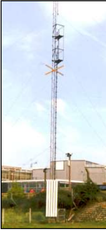
Front Light, with painted square daymark on wall of building behind