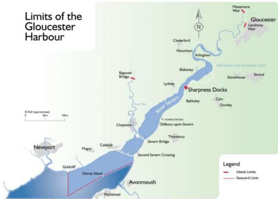
Figure 1 – Definition of Gloucester Harbour

The Gloucester Harbour includes the estuarial waters of the River Severn upstream of a line joining Goldcliff on the Welsh shore, Denny Island and a point south of Severn Beach on the English shore to Llanthony and Maisemore Weirs at Gloucester and the River Wye downstream of Bigsweir Bridge. This involves some 50 nautical miles of tidal waters. Figure 1 refers.