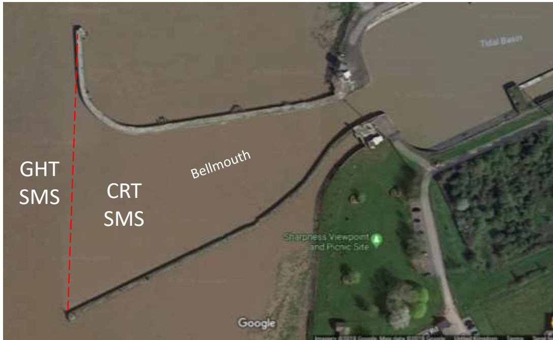
Figure 2 – The interface at Sharpness between the CRT SMS and the GHT SMS

Pilots are provided by GHT for vessels transiting the estuary defined as being inside Gloucester Harbour limits; GHT’s responsibility for pilotage finishes once a vessel is inside the Bellmouth east of the red line shown in figure 2.