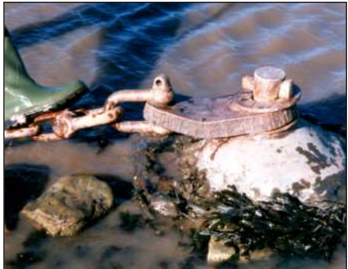
Counts Buoy rock mooring (typical system)

A lantern utilising modern Light Emitting Diode (l.e.d.) technology was installed in September 2000. The reduced power consumption enabled the number of batteries on the buoy to be reduced to one. A solid-state voltage regulator replaced the electro-mechanical unit which had been installed previously.