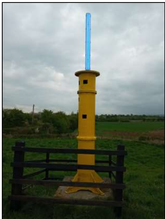
Present day (2020)