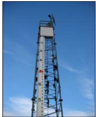
Bull Beacon (2005)