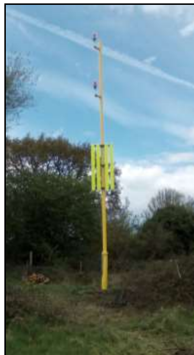
Present light (2018)