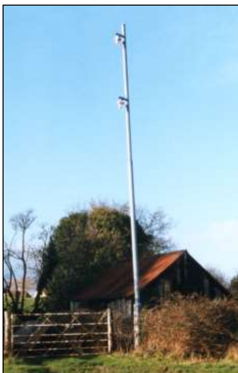
New mast (1990)