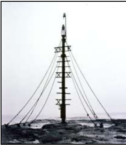
Bull Beacon (1980)

Description: 15m steel lattice mast, white daymark and tide gauge