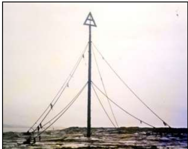
No. 2 Beacon (North)

These beacons were removed in 1993 to be replaced by the four concrete beacons which define the deep water channel beneath the new bridge. These four beacons were last repainted in 2013.