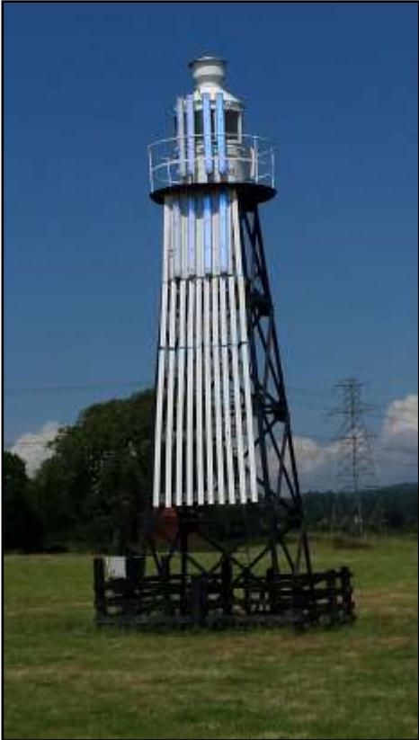
Front light dating from 1910, replaced in 2022

Due to deterioration of the steel lattice tower, the front light was replaced by a new 10mtr hydraulically lowered Abacus steel column in February 2022 (see photo previous page).