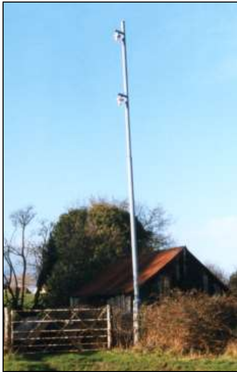
New mast (1990)