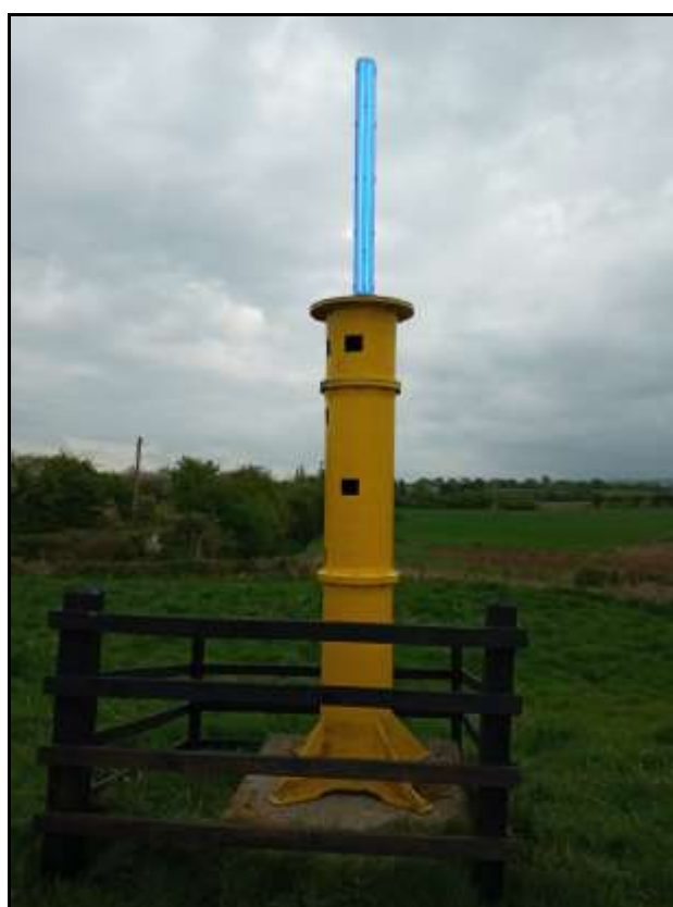
Present day (2020)