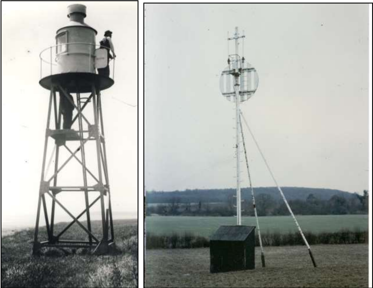
Inward Rocks: Front light (post-1907) and rear beacon (viewed from the NE) following electrification in 1962.