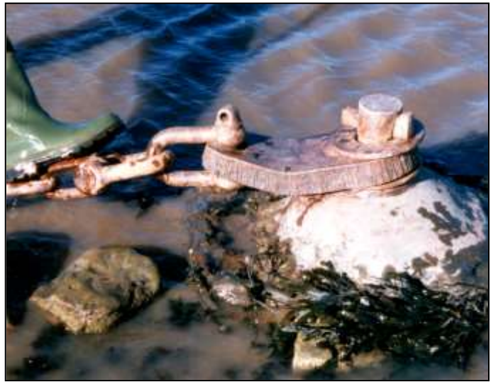
Counts Buoy rock mooring (typical system)

A lantern utilising modern Light Emitting Diode (l.e.d.) technology was installed in September 2000. The reduced power consumption enabled the number of batteries on the buoy to be reduced to one. A solid-state voltage regulator replaced the electro-mechanical unit which had been installed previously.