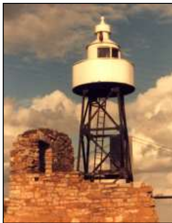
Appearance in 1979