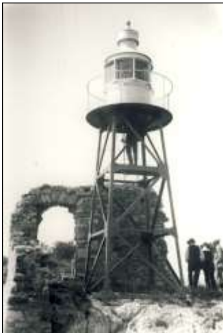
Newly built 1907