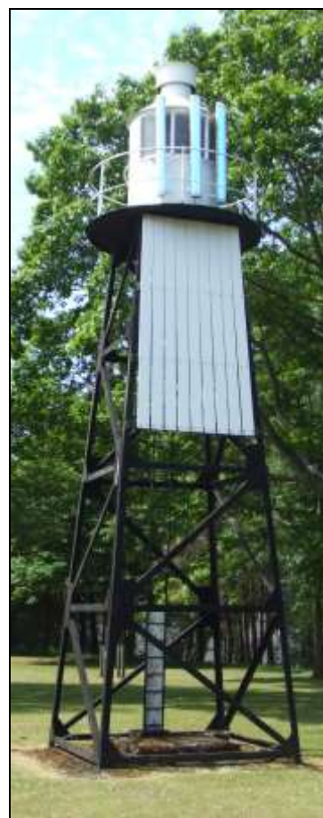
Above: Slime Road front light, early 1900s