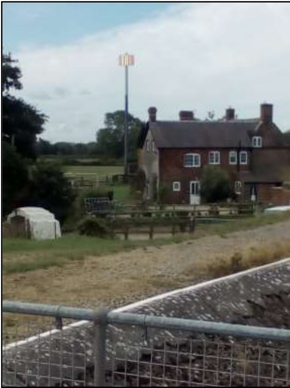
(Above: extended mast, August 2018)