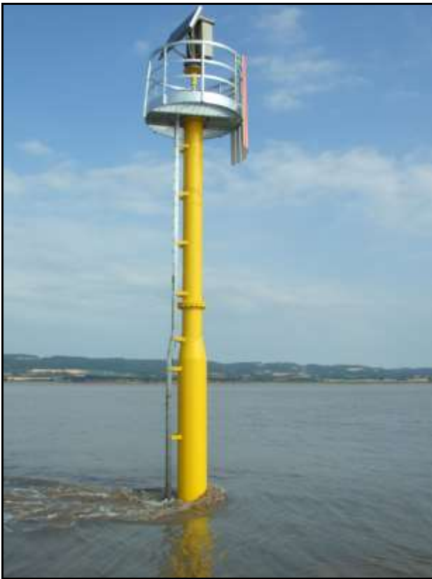
Front mast (July 2018)

Description: Steel masts, yellow with orange daymarks, 12m (front) and 17m (rear) synchronised solar powered white flash every 2 seconds. Provides a leading line for the Hills Flats channel.