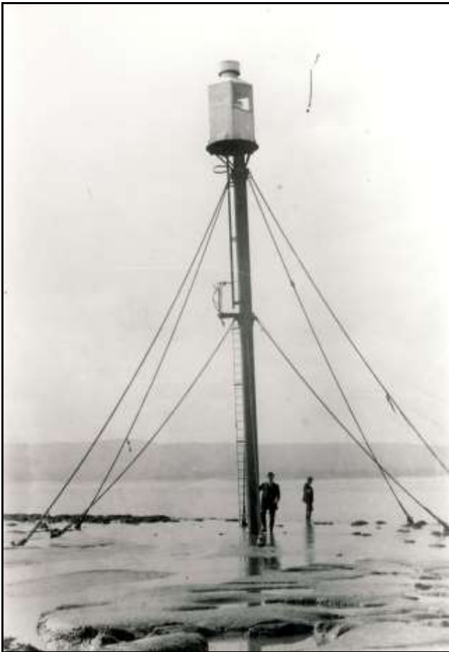
Oil lighting, early 1900s

Self-righting beacons ( below right ) were installed in 1964 when an offshore reservoir was constructed to supply cooling water to the nuclear power station at Oldbury on Severn. The gas lighting was replaced by solar panels and batteries in 1987.