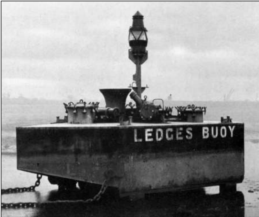
Ledges Buoy as installed in 1961 showing pockets for the dissolved acetylene gas and CO 2 cylinders, bell and lantern.