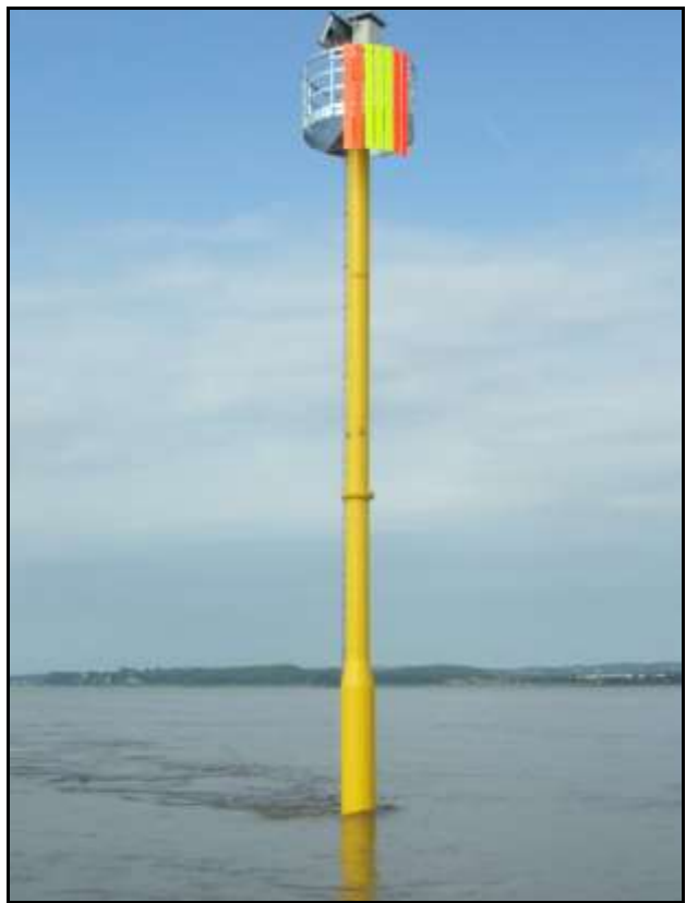
Rear mast (July 2018)