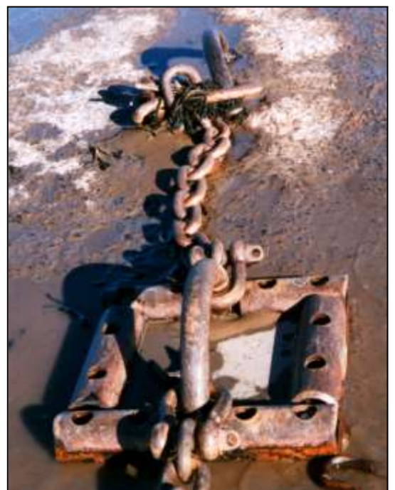
Mooring arrangement for Ledges Buoy showing additional (square) anchor point bolted to river bed and installed after original mooring ring had all but worn through.