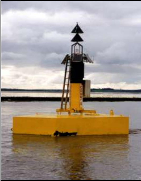
Former Counts Buoy

A boat-shaped buoy was installed in 1961. Originally fitted with gas powered light and bell, this mark was converted to battery and solar panel operation in 1986.