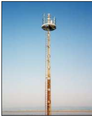
Bull Beacon (1988)