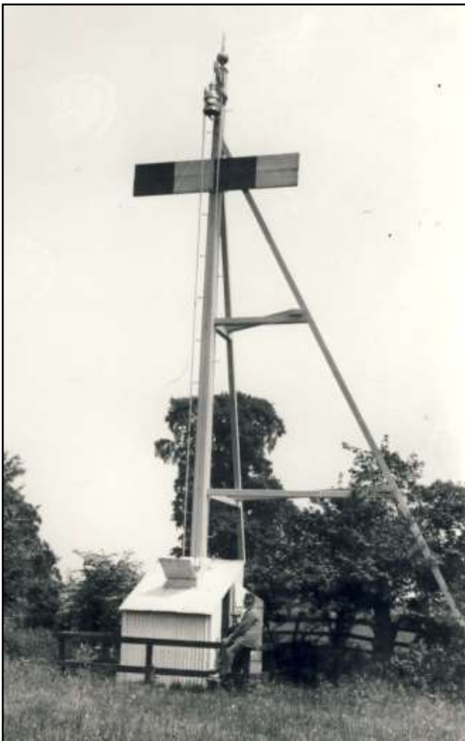
Left: Conigre back light, early 1900s

Two fixed white lights were in use at Conigre in 1891. They were used to indicate the “low way” across the Lydney Sand from Guscar Rocks. A green sector showing over the Bull Rock was in place in 1888. It is not known when this sector was discontinued. The oil lamps were replaced in June 1948 with Londex battery powered items which exhibited a flashing characteristic; these remained unsynchronised until 1953. The construction of the nuclear power station at Berkeley led in 1960 to the erection of two steel lattice towers fitted with mains powered fluorescent lighting. Improved daymarks were fitted in August 2018.