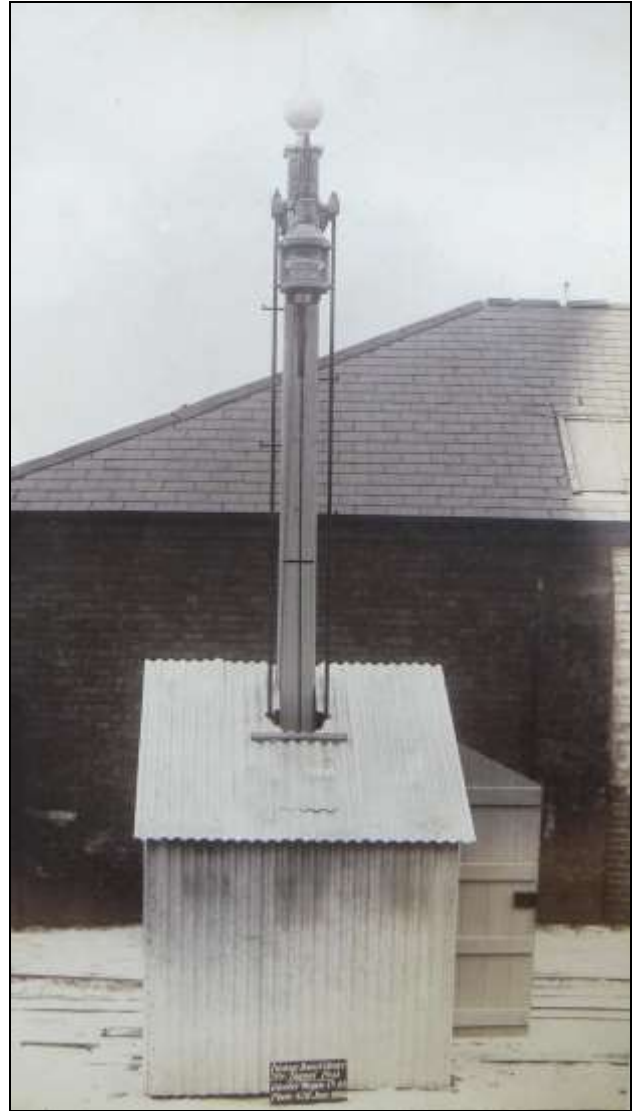
photograph album reference number D4791/16/2a