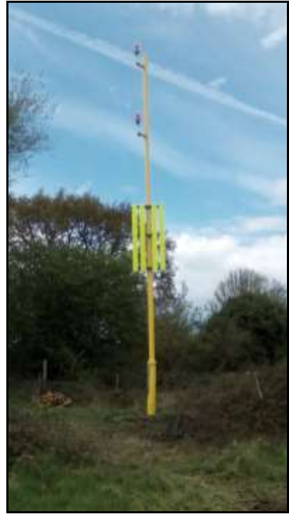
Present light (2018)